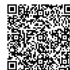
Keep Hawai'i Beautiful