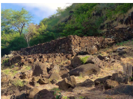
Pahua Heiau Restoration, 1984

The Outdoor Circle's history over the last 112 years is filled with well-recognized significant achievements, such as our 1912 campaign to eliminate billboards from the Territory of Hawai'i, and subsequently from the State. Hawai'i's billboard free environment is now the envy of the nation. Our tree planting and tree preservation projects started in urban Honolulu in 1912 and have spread throughout communities across the islands, with over one million trees planted to date .