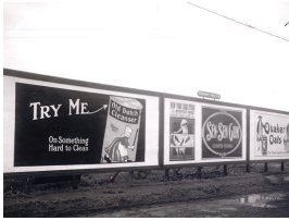
Started Campaign to Ban Billboards, 1912: Spearheaded enactment of Hawai'i's first signage laws, 1927 & state sign laws, 1957