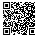
Ways to Give