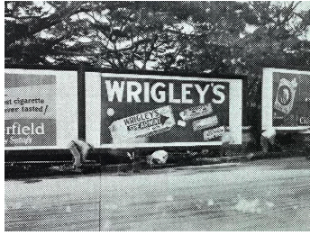
Honolulu's Streets in 1920 . . .