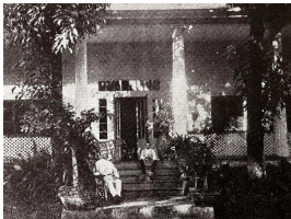
Queen Emma Summer Palace After Restoration, 1913