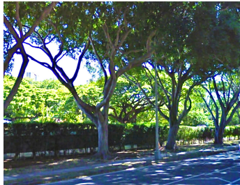
. . . And today

experts, and engaged community members who care deeply about maintaining the beauty of our island state. We maintain a small, dedicated central office staff headed by an Executive Director, all of whom have extensive backgrounds in environmental sciences and non-profit operations.