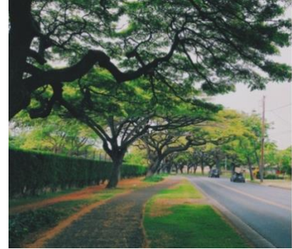
Exceptional Trees on Paki Avenue, Honolulu

Today, The Outdoor Circle has branches in communities across the State, from Kauai to Hawaii Island. Through their volunteerism and civic engagement, our members work not only to enhance our public green-scapes through community-based beautification and tree planting projects, but to educate the public about the value of trees. We rehabilitate and preserve native forests and ecosystems, maintain our scenic view planes, green spaces and nature parks, protect and promote wetlands and watersheds and advocate for sound public policies ensuring the protection of Hawaii's natural resources and unique environment.