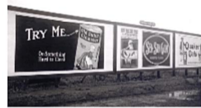
Started Campaign to Ban Billboards, 1912: Spearheaded enactment of Hawaii's first sign laws, 1927 & state sign laws, 1957

The Outdoor Circle's history over the last 111 years is filled with well-recognized significant achievements, such as our 1912 campaign to eliminate billboards from the Territory of Hawaii, and subsequently from the State. Our many tree planting and tree preservation projects started in urban Honolulu and have spread throughout communities across the Islands, with over one million trees planted to date .