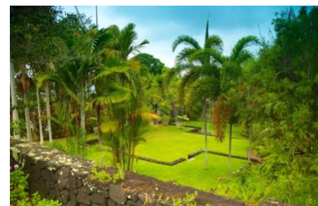
Sadie Seymour Botanical Gardens, Kona 1986

The Outdoor Circle founded the Hawaii Nature Center in Makiki, Oahu in 1981, the Sadie Seymour Botanical Gardens in Kona in 1986, the Ulu La'au Nature Park in Waimea, Hawaii Island in 1999, and helped spawn the Waikoloa Dry Forest Initiative in 2014 ... thus cultivating and fostering the public's appreciation for and stewardship of Hawaii's unique natural environment.