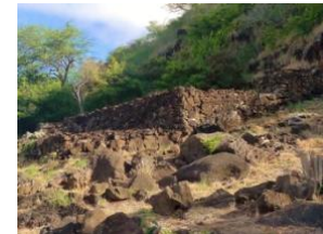
Pahua Heiau restoration 1984

of Washington Place in the 1930s and again in 1963. The Outdoor Circle led the clearing for archeological inspection of Ulupo Heiau in Kailua, Oahu in 1951 and restored Pahua Heiau in Hawaii Kai, Oahu in 1984 ... thus helping preserve these valuable cultural and historical resources for the benefit of all of Hawaii.