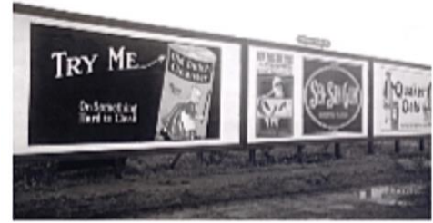
Started Campaign to Ban Billboards, 1912: Spearheaded enactment of Hawai'i's first sign laws, 1927 & state sign laws, 1957

The Outdoor Circle's history over the last 111 years is filled with well-recognized significant achievements, such as our 1912 campaign to eliminate billboards from the Territory of Hawaii, and subsequently from the State. Our tree planting and tree preservation projects started in urban Honolulu and have spread throughout communities across the Islands, with over one million trees planted to date .