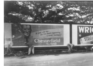
Honolulu Streets @1920 ... And Today

Today, The Outdoor Circle has branches in communities from Kauai to Hawaii Island, who, through their volunteerism and civic engagement, strive not only to enhance our public green-scapes through community-based beautification and tree planting projects, but to educate the public about the value of trees and the importance of environmental stewardship.