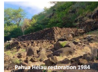
Pahua Heiau restoration 1984

Circle led the clearing for archeological inspection of Ulupo Heiau in Kailua, Oahu in 1951, and