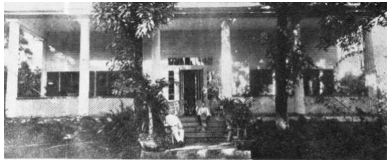
Queen Emma Summer Palace after restoration 1913

In 1913, The Outdoor Circle collaborated with the "Daughters of Hawaii" to save the deteriorating Queen Emma Summer Palace from demolition to install a baseball park. In 1914 and